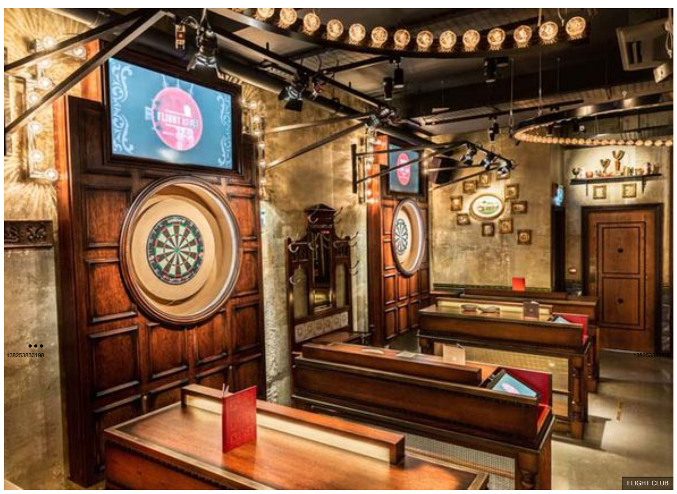
Flight Club: Inside the club they opted for traditional decor

Flight Club Bloomsbury is set over two floors with 9 oches and a capacity of 250.