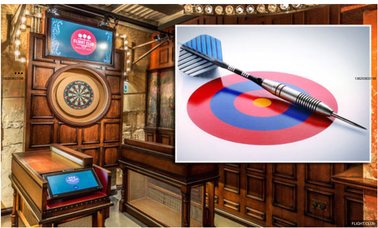
Flight Club: There is a new trendy bar in London where darts is on the cards

DARTS isn't just for pubs or serious sportsmen anymore, Flight Club has reinvented the look of the game and made it trendy for the masses.