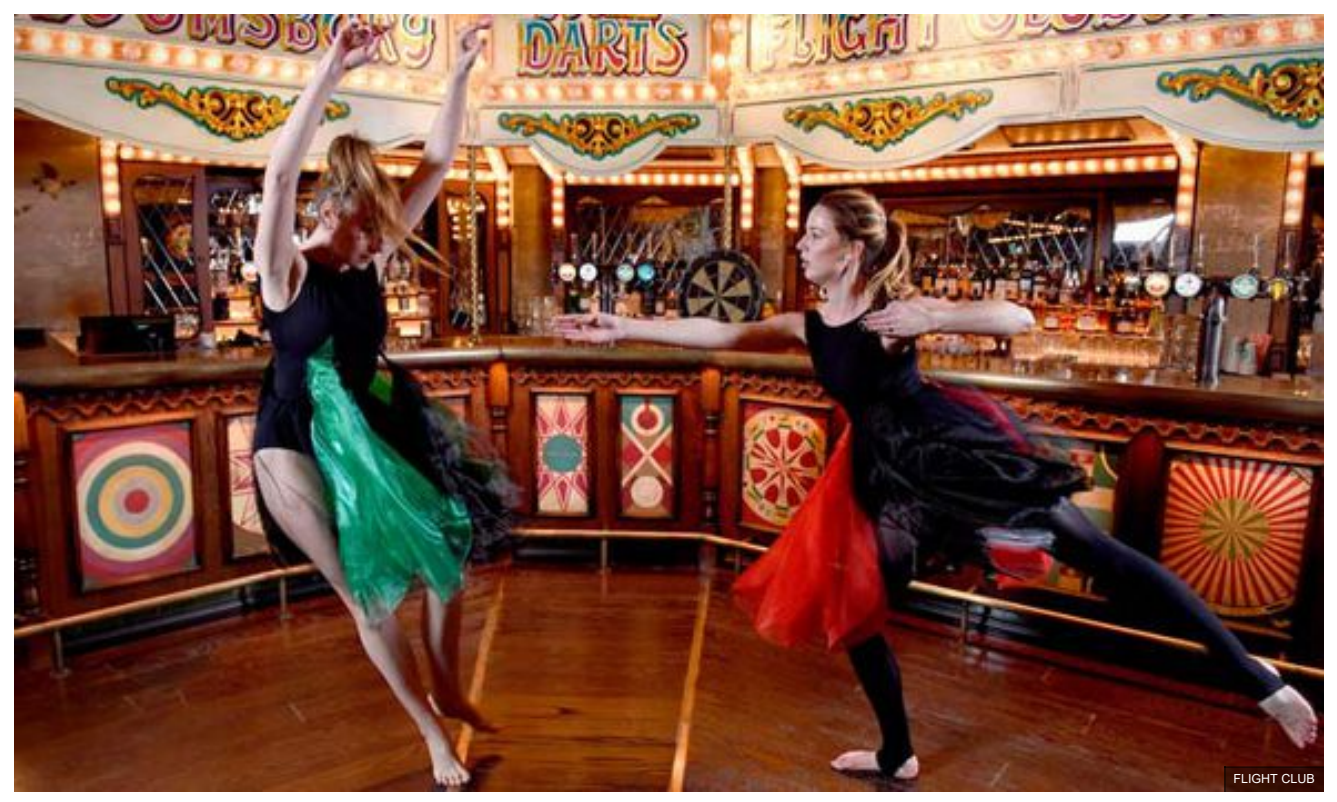
Flight Club: Darts: The Ballet was unveiled by Flight Club as an homage to its new bar