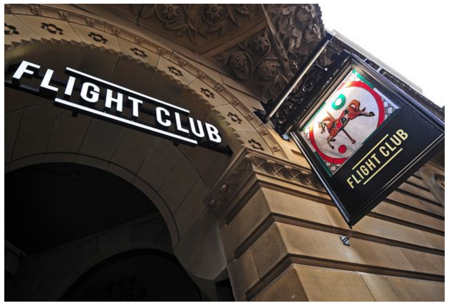
o Flight Club has taken over the former Burger & Lobster site

Flight Club's version of the game features a patented darts tracking system, using cameras to track and instantly calculate scores, so there's no need for players to keep count.