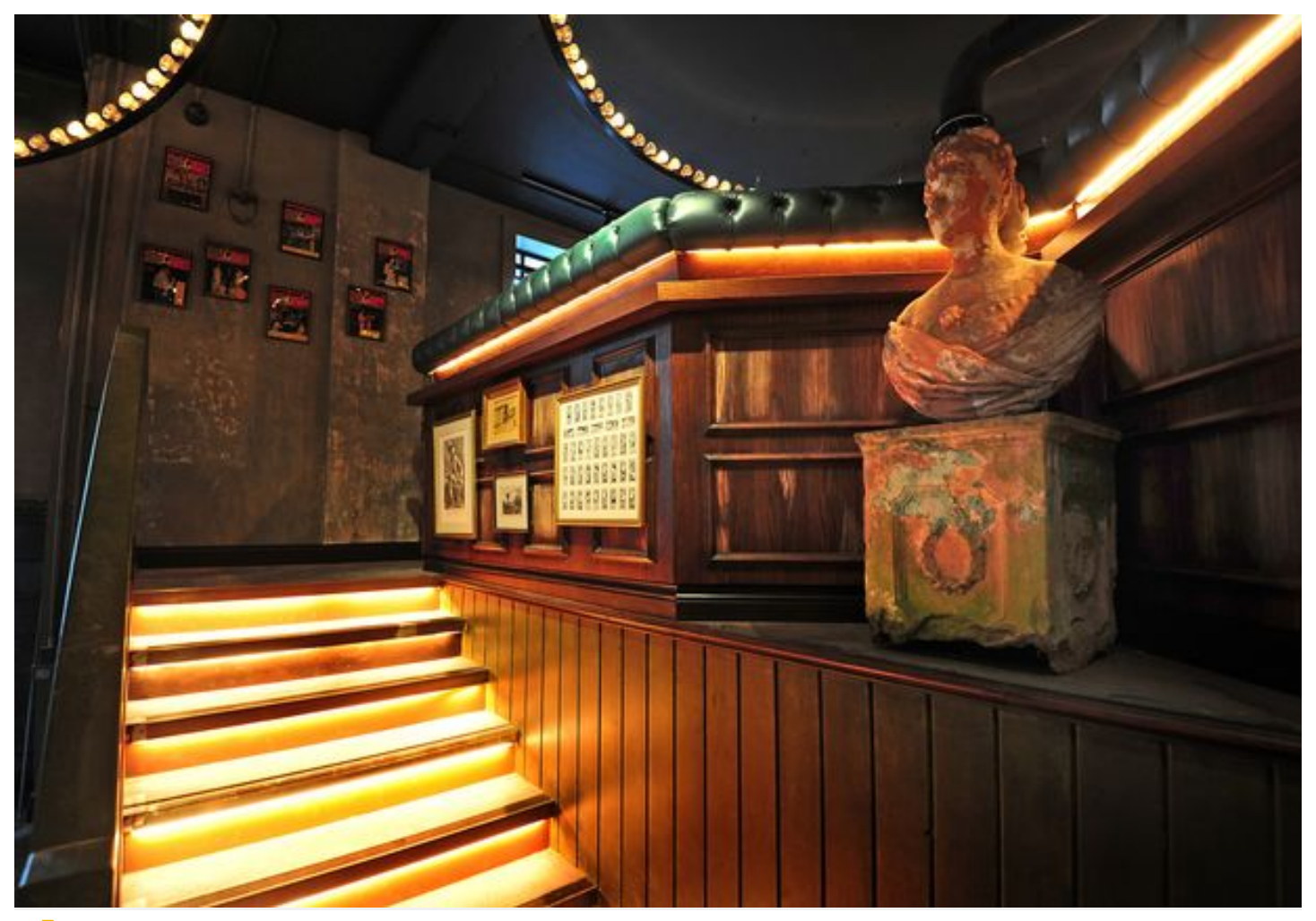
King Street's Flight Club

Oche hire costs £30 an hour but the venue is also open to non-players who want to eat or drink in the bar.