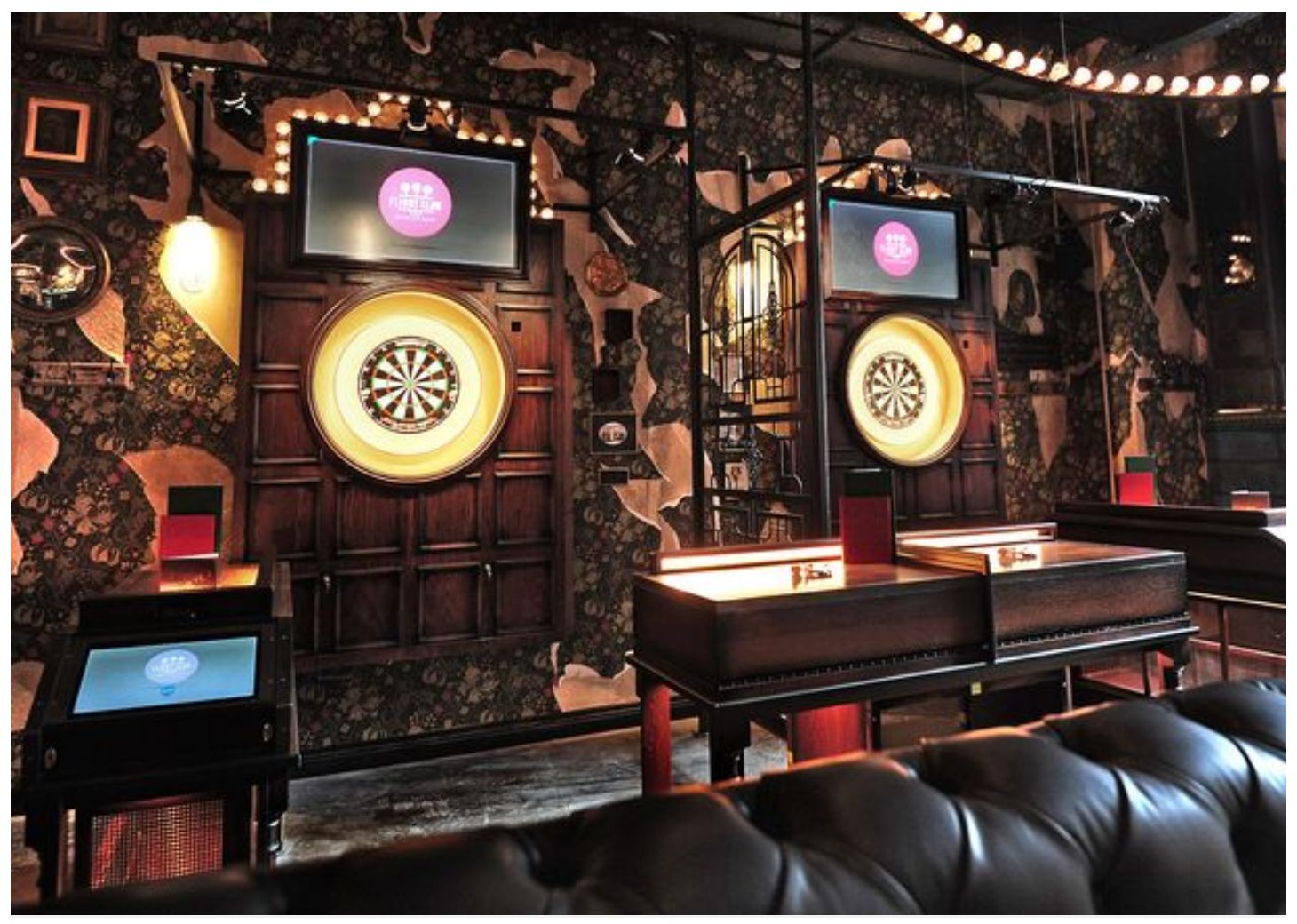
Dart booths at Flight Club

Harking back to the game's roots in the fairground, a huge carousel style bar dominates the main room, which is festooned with carnival lights and surrounded by intimate oches (playing areas).