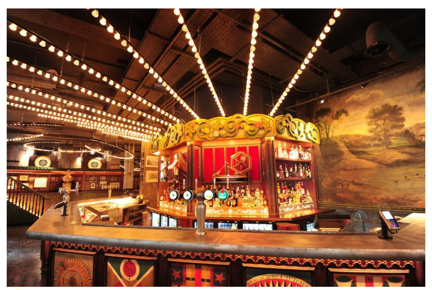
First look at Manchester's Flight Club

From axe-throwing to baseball, a night out in Manchester is no longer complete without a competitive edge.